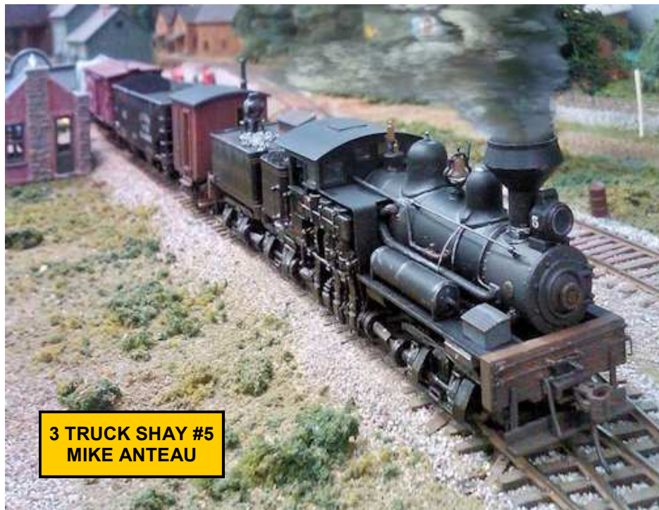
3 TRUCK SHAY #5 MIKE ANTEAU

Your photo can be here if you just send us one.