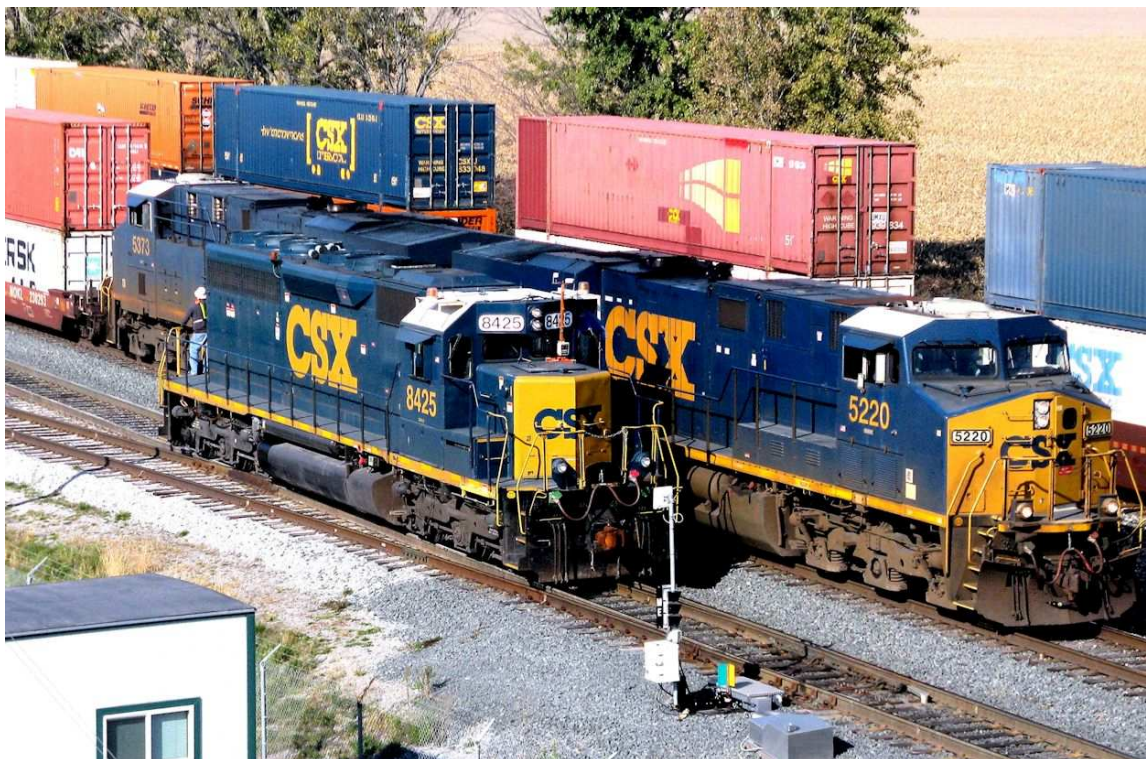
East end of the CSX intermodal yard—North Baltimore, Ohio